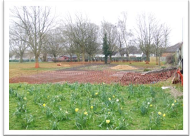
Photo taken 29th March as work begins

Griffiths are committed to working with local communities to improve the local environment and this project is a key part of the Community Benefits Plan for the Bishopsworth ward.