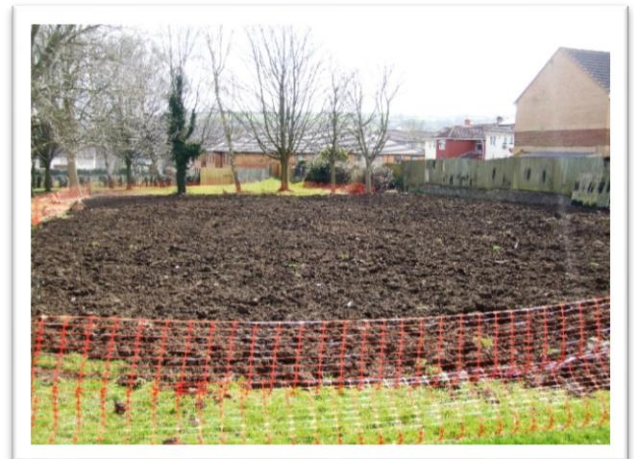
Photo taken 6th April 2016 after groundwork